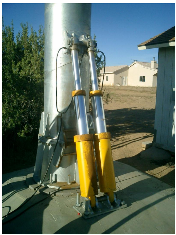
Product Overview & Specifications