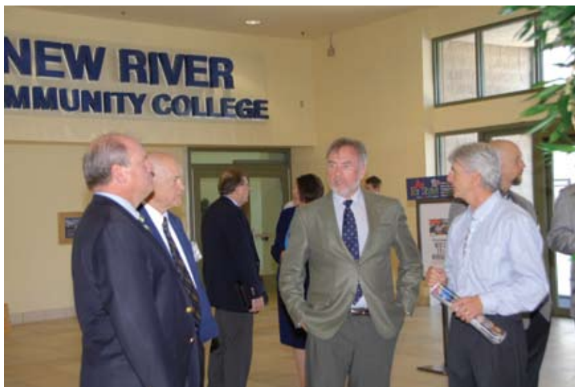
State officials visit mall site