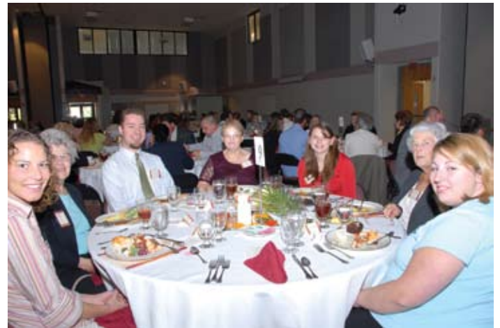
Foundation sponsors event for students and donors