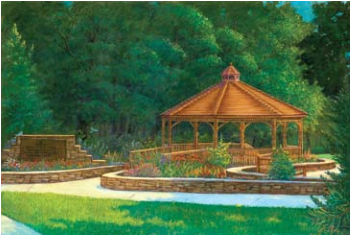
NRCC Learning Park

Greetings alumni and friends! As winter sets in, exciting events keep happening at NRCC. Keep reading for the latest news and updates.